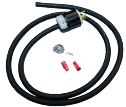
20 Amp 1 Ph. Cord shown Receptable not shown

We reserve the right to change specifications and product designs without notice. Such revisions do not entitle the buyer to corresponding changes, improvements, additions, or replacements for previously purchased equipment.